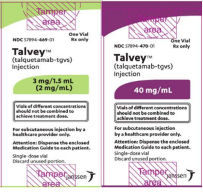
Figure 1. Principal display panels on cartons of Talvey 3 mg/1.5 mL (left) and 40 mg/mL (right).

Potential for mix-ups between Talvey and Tecvayli. We wanted to warn practitioners about the potential for mix-ups between TALVEY (talguetamab-tgys) and TECVAYLI (teclistamab-cqyv). Both products, made by Janssen, are indicated for the treatment of adult patients with relapsed or refractory multiple myeloma after previously receiving at least four prior lines of therapy. While Tecvayli has been approved for nearly a year, Talvey was approved this past August. At issue are the multiple overlapping characteristics, including similar brand and generic names; similar-looking carton principal display panels (Figures 1 and 2): and the fact that each is packaged as a single-dose vial, administered subcutaneously, and requires refrigeration for storage.