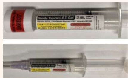
Figure 1. When practitioners remove the cap (top) from the topical lidocaine, EPINEPH rine, and tetracaine gel by Fagron, they can attach a needle to the parenteral syringe (bottom) or connect the syringe to an IV set.

Practitioners also notified us that Fagron (a 503B outsourcing facility) prepares topical lidocaine, EPINEPH rine, and tetracaine (referred to as L.E.T.—an abbreviation we do not recommend using) gel in a parenteral syringe ( Figure 1 ). While it has a warning in small font on the syringe barrel, "TOPICAL USE ONLY," and a larger warning on the cap, "FOR EXTERNAL USE ONLY," practitioners may miss these warnings after removing the cap prior to administration. In case you think a wrong route error won't happen, in May 2022, we described an error in which a nurse administered a topical medication into a patient's gastrostomy tube (G-tube) ( www.ismp.org/node/31478 ).