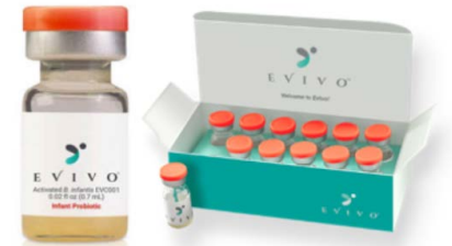
Figure 1. Evivo is provided in a vial (left) that resembles those used for parenteral injection and comes in boxes of 12 vials (right).

0.7 mL. Although it is intended for resolving gut dysbiosis when given to patients via enteral feeding tubes in neonatal intensive care units (NICUs), the packaging resembles vials used for parenteral injection ( Figure 1 ).