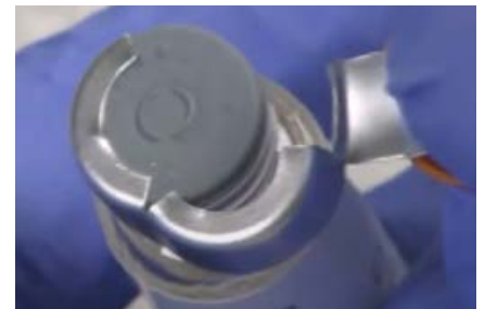
Figure 2a. After the cap is removed, the metal ferrule needs to be peeled away from the rubber stopper.

The manufacturer's website provides written instructions ( www.ismp.org/ext/1055 ) and a video ( www.ismp.org/ext/1056 ) on how to remove the cap, the foil ferrule, and the rubber stopper ( Figures 2a and 2b ) to access the vial's contents with an ENFit syringe. However, if practitioners are not familiar with the instructions, they may withdraw the dose using a parenteral syringe and needle as the product looks like a parenteral medication vial.