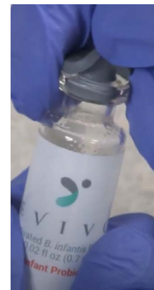
Figure 2b. The last step for accessing the contents is to remove the rubber stopper from the vial.

In addition, the vial label warning "For Enteral or Oral Use" is not well positioned as it is only visible when the vial is turned to read the back edge of the label ( Figure 3 , on page 3). Whenever a substance meant for one route is placed in packaging more typically used for another route,