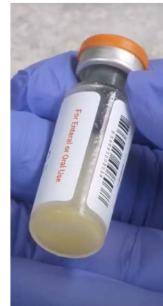
Figure 3. The "For Enteral or Oral Use" warning printed on the Evivo vial is not visible unless practitioners turn the vial to read the back edge of the label.

the chance of administering the substance by the wrong route is increased.